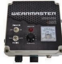
TM-MCB Main Control Box