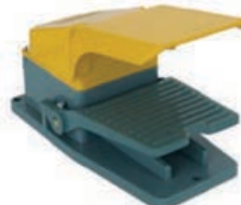
TM-FP Foot Pedal