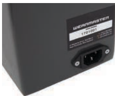
Power Inlet Socket / Serial Number