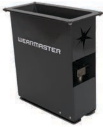
TM-HOPP Hopper / TM-VU Vibratory Feeder Unit